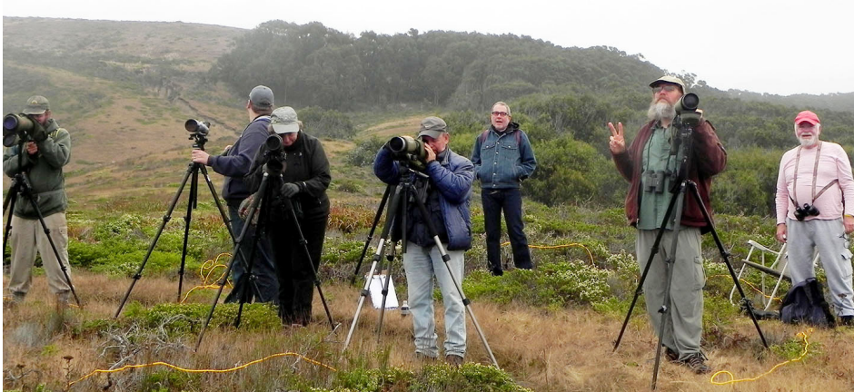
The First Big SIT! October 9, 2011 at Pescadero Marsh.