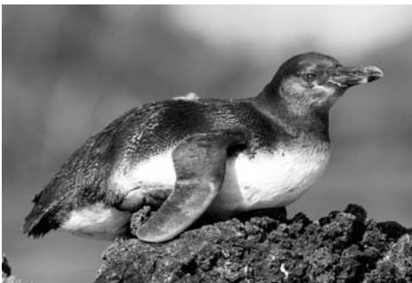
Galapagos penguin.

Over the years she has captured thousands of images of these very special and delightful marine birds!