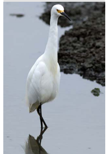
Snowy Egret at Hayward Shoreline Center

Check the field trip descriptions for any special information or requirements. Late comers may be disappointed. For all field trips bring your binoculars, a hat, sun block, and water; wear sturdy walking shoes or boots, and always dress in layers for hot, sunny weather to cool, windy conditions. While we will attempt to stay on schedule, circumstances may dictate changes to field trip leaders, dates, or times. For the latest schedule and updates, always go the Sequoia Audubon web site; contact the trip leader, or call Carol Masterson at (650) 347-1769.